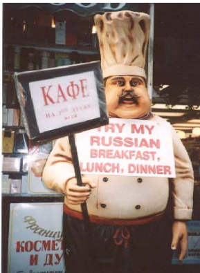
A local Russian restaurant advertisement in Brighton Beach, Brooklyn.